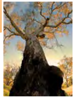
Overall Winner (above) Open Winners (below)