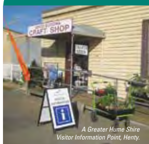
A Greater Hume Shire Visitor Information Point, Henty.