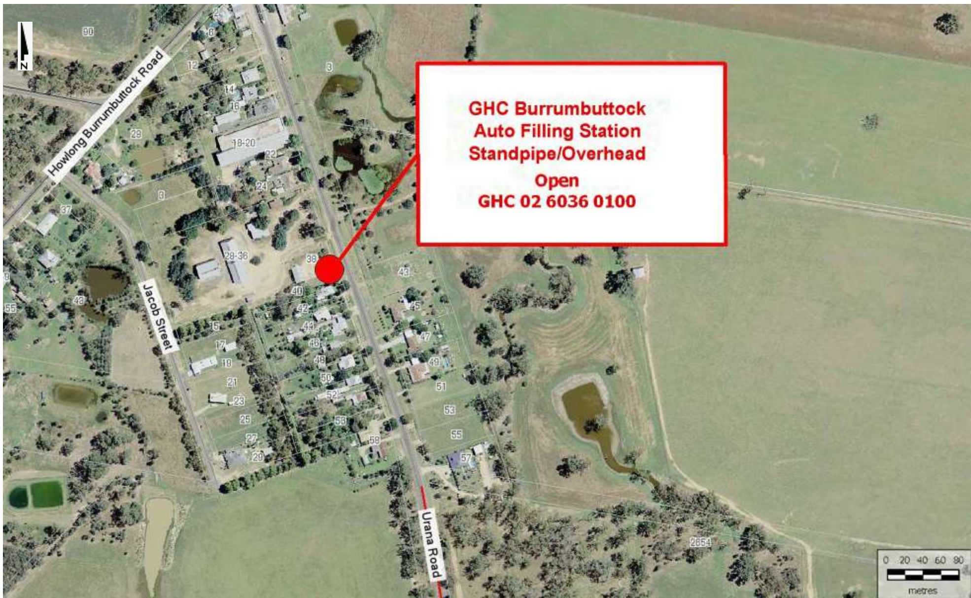
Map 7 - Burrumbuttock Auto Water Filling Station (See photo Page 15)

Location: Urana Road Rural Fire Service Shed. Open