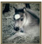
Multiple Royal Show winners. Led, Saddle and Harness. Visitors by appointment only. 0260296112.