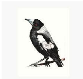
“Gerogery”, Wiradjuri word for Maapie