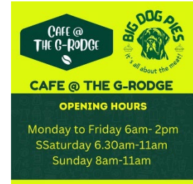
Café at the G-Rodge