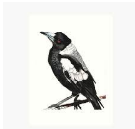
"Gerogery", Wiradjuri word for Magpie