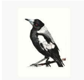
"Gerogery", Wiradjuri word for Magpie