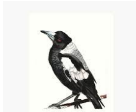
“Gerogery”, Wiradjuri word for Magpie