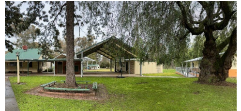
Gerogery Public School