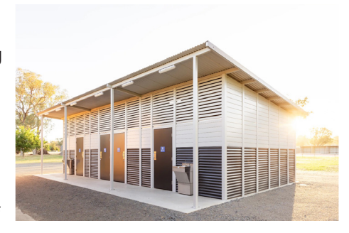
Pic Burrumbuttock - New toilet facilities.