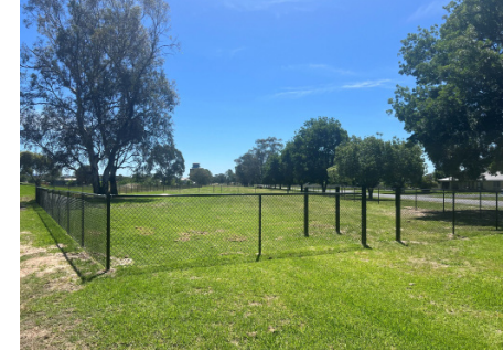
Pic Holbrook Dog Park