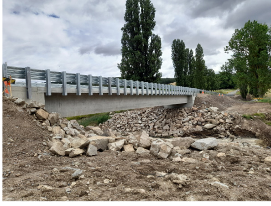
Pic Coppabella Bridge along Coppabella Road

Greater Hume Council Engineering Department now provide a weekly works schedule on our website, go to https://www.greaterhume.nsw.gov.au/Living-in-Greater-Hume/Works-and-Projects to access.