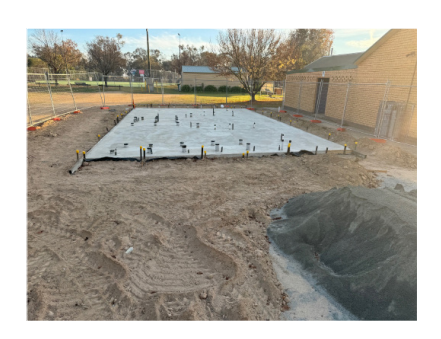
Pic Burrumbuttock - Concrete slab poured for the toilet building.