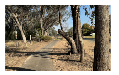
Pic Culcairn - The completed Bike Path upgrade.