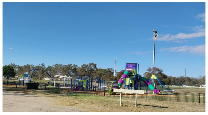
Pic New Adventure Playground at the Jindera Recreation Ground.

Greater Hume Council Engineering Department now provide a weekly works schedule on our website, go to https://www.greaterhume.nsw.gov.au/Living-in-Greater-Hume/Works-and-Projects to access.