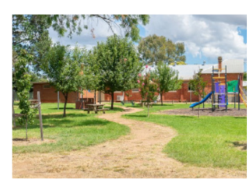
3 Community Projects Learn about the current community projects underway across Greater Hume.