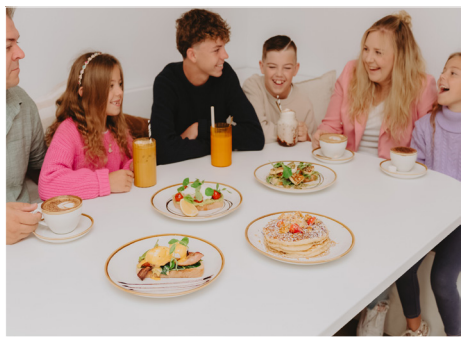
Pic Family breakfast at Fox and Brew, Jindera

nature at the Wirraminna Environmental Education Centre in Burrumbuttock. Whether you're camping, hiking, or mountain biking, these spots cater to all your adventurous needs. Pack a picnic, lace up your hiking boots, and bring your binoculars to enjoy the tranquillity, fresh air, and quality family time.