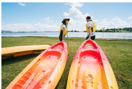
Pic Kayak on Lake Hume

When the summer heat arrives, families can cool off in the swimming pools of Culcairn, Henty, Holbrook, Jindera, and Walla Walla. These picturesque towns offer the perfect place to take a refreshing dip, whether you're floating lazily on a hot day or racing your family to the pool's edge. The sound of splashing and laughter will fill the air as everyone enjoys the fun and relaxation of the water.