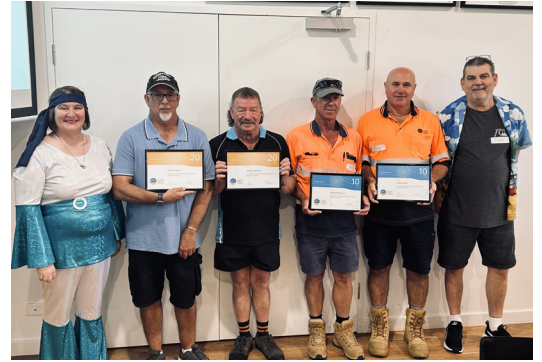
Pic Council Long Service Award Recipients

Greater Hume Children Service will be closed over the Christmas/New Year period from 5.00pm Friday, 20 December 2024, reopening 8.30am Wednesday, 8 January 2025.