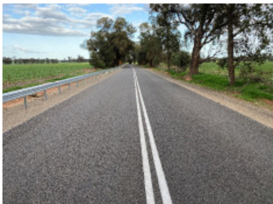
Pic Brocklesby Balldale Road Reconstruction.

Greater Hume Council Engineering Department now provide a weekly works schedule on our website, go to https://www.greaterhume.nsw.gov.au/Living-in-Greater-Hume/Works-and-Projects to access.