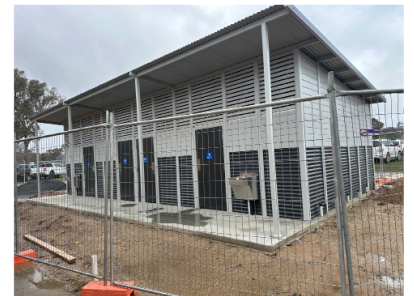
Pic Burrumbuttock - New toilet facilities