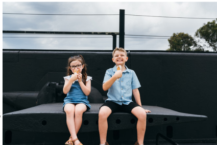
Pic Enjoy a sweet treat at the Submarine Park, Holbrook

In the beautiful town of Jindera, the Jindera Pioneer Museum invites families to join in a thrilling treasure hunt that's fun for all ages. Kids and adults alike will be swept up in the excitement as they explore the museum's gardens and displays.