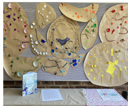
Pic Collage made at National Simultaneous Storytime at Holbrook Library.

Follow the Greater Hume Council Social Media pages for more information about this event and more that is happening throughout the year!