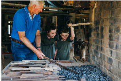
Pic Blacksmith display at the Headlie Taylor Header Museum, Henty

Begin your journey at the Doll Museum and Historical Treasures in Gerogery, housed within a quaint historical church. Marvel at a delightful array of dolls, teddies, prams, and collectibles dating back to the 1880s.