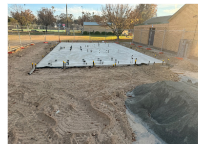
Pic Burrumbuttock - Concrete slab poured for the toilet building.