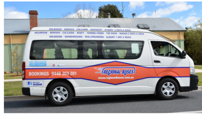
Pic The Regional Bus available in many Greater Hume locations.

The Regional Bus On Demand Service links the Greater Hume communities and is now also offering parcel pick up as well as it's normal bus service. The towns and villages being serviced are Albury, Burrumbuttock, Culcairn, Henty, Holbrook, Jindera, Morven, Gerogery, Gerogery West, Mullengandra, The Rock, Uranquinty, Wagga Wagga, Walla Walla and Woomargama.