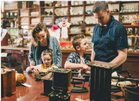
Pic Inside the Jindera Pioneer Museum.

Next, venture to Culcairn and step into the Station House Museum, a testament to the grand railway expansion of yesteryears. Explore early railway memorabilia within the charming two-story brick building, adorned with intricate wrought iron and original floors and ceilings.