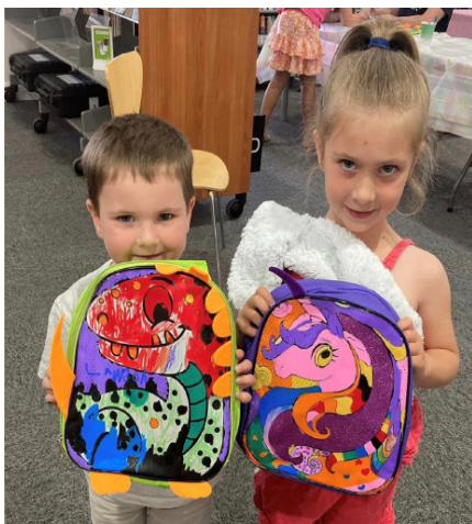
Pic July School Holiday backpack decoration ideas.

Please phone your library for date and time on 02 6036 0100.