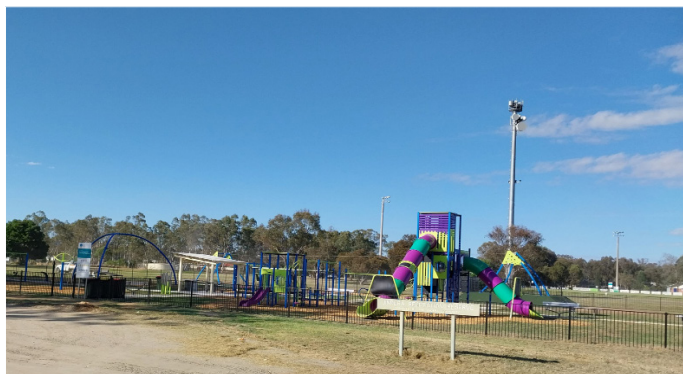
Pic New Adventure Playground at the Jindera Recreation Ground.

Greater Hume Council Engineering Department now provide a weekly works schedule on our website, go to https://www.greaterhume.nsw.gov.au/Living-in-Greater-Hume/Works-and-Projects to access.