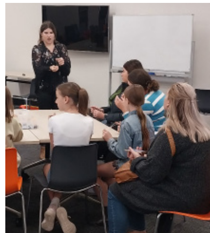
Pic Creative with Clay workshop at Jindera.

For further information or bookings please contact T: 02 6036 0100.