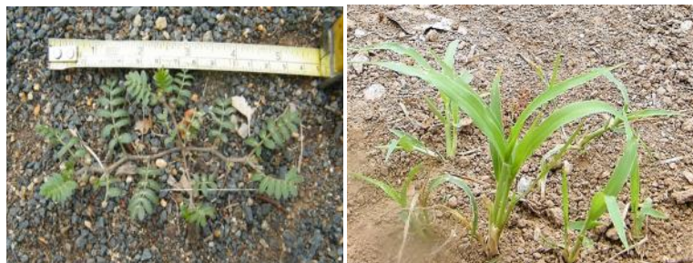
Bindii Weeds and Hairy Panic Weeds at Walla.

Other weeds up and about are sticky weed (it sticks to your hand when you touch it. It is easy to pull out), marshmallow (umbrella shaped leaves, small ones are easy to pull out, chip out larger ones), cape weed (saw shaped leaves, daisy shaped yellow flowers, can be sprayed, too many to have eradication), bridal creeper (beautiful small green leaves, easy to spray or pull out), fleabane (grows straight up with floppy leaves, has just started this year) but most important of all watch out for the first bindii, our biggest concern. See photo below, taken on November 11 th last year. The plant is a few days old. We still have some seeds in Walla, as I found out a week ago, when I rode my bike on a grassed area. There was a seed there from last year or long ago, and I got a puncture. That seed is now buried deep underground at the tip.