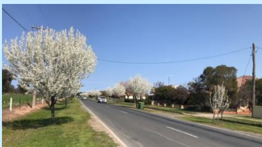
Street scene: flowered trees