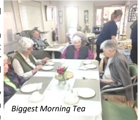
Biggest Morning Tea

having their hair set and blow-dried, and enjoyed a photo shoot with our talented local photographer Leanne Bickley followed by a BBQ lunch