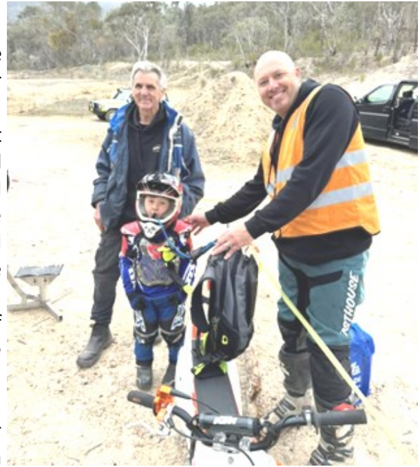
First day out for this little chap.

Our next Enduro event will be in September. Saturday the 14 th will see the ever popular Cookardina Vinduro where the vintage enthusiast bring their old clangers out of the sheds to test their reliability and performance on the rolling country on the Jones' Cookardina block. On Sunday 15 th September the track will open to all age riders and bikes again for another Ride Park Day. Keep an eye on the HMCSC's web and Facebook page for more information.